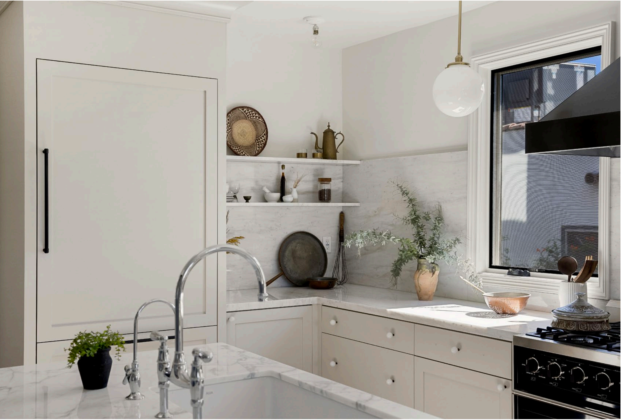
SILVERLAKE RESIDENCE – Integral stone shelving and millwork for custom kitchen