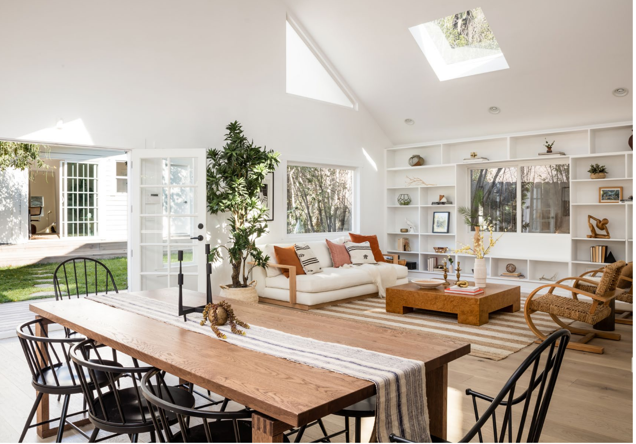
VENICE RESIDENCE – Modern addition for traditional bungalow