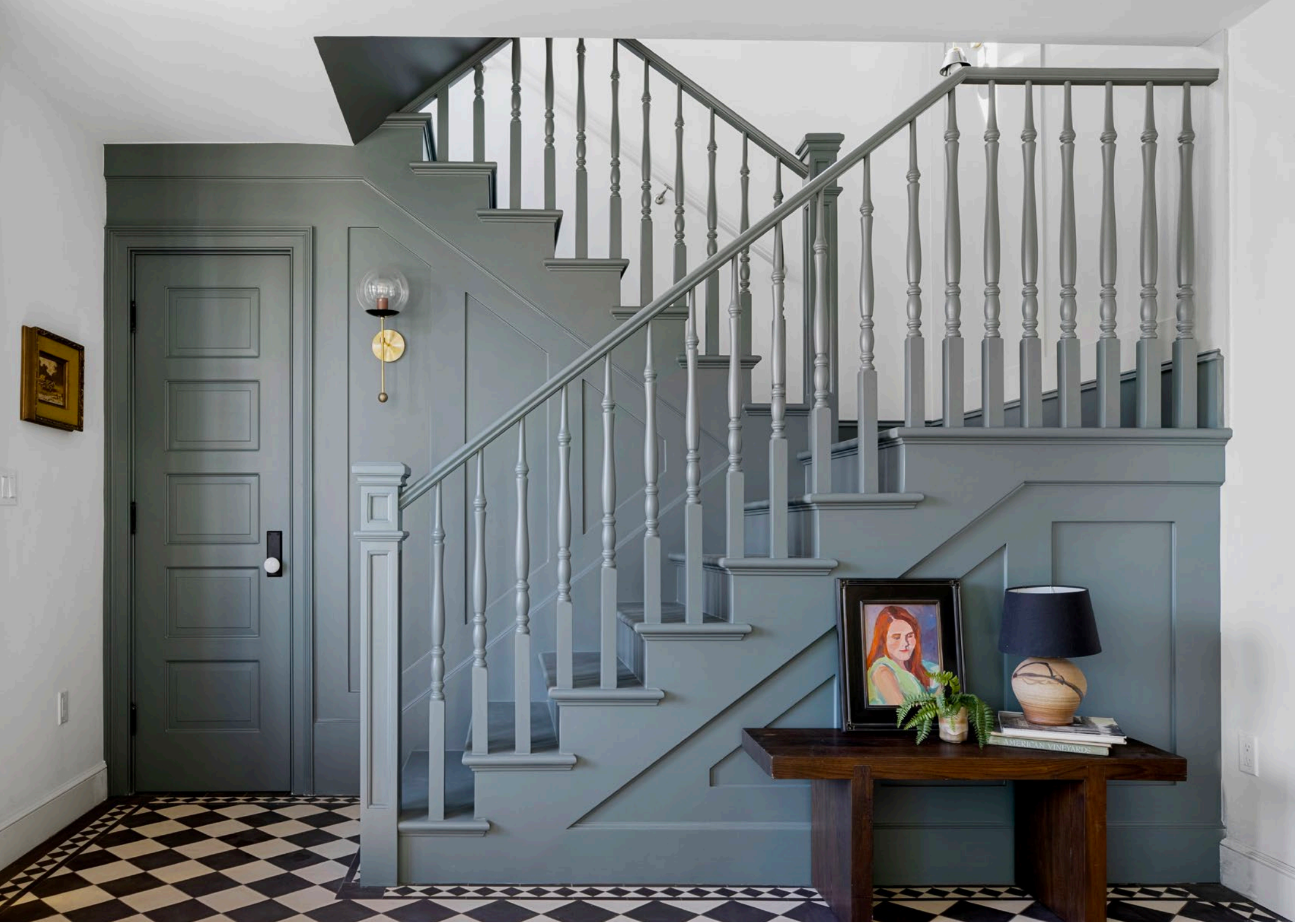
SILVERLAKE RESIDENCE – Ornate millwork and tile study